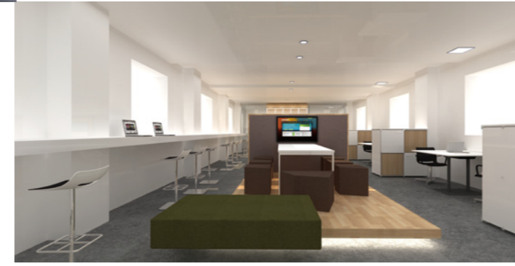
↑ "M-Office" 楼二楼层内景

Maintain open sight, while having a clear division of functions. Designers will have counter workspace, Independent work areas, Meeting forums, and the team workspaces which naturally transition in the room, making it a functionally independent open space.